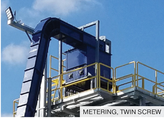
METERING, TWIN SCREW