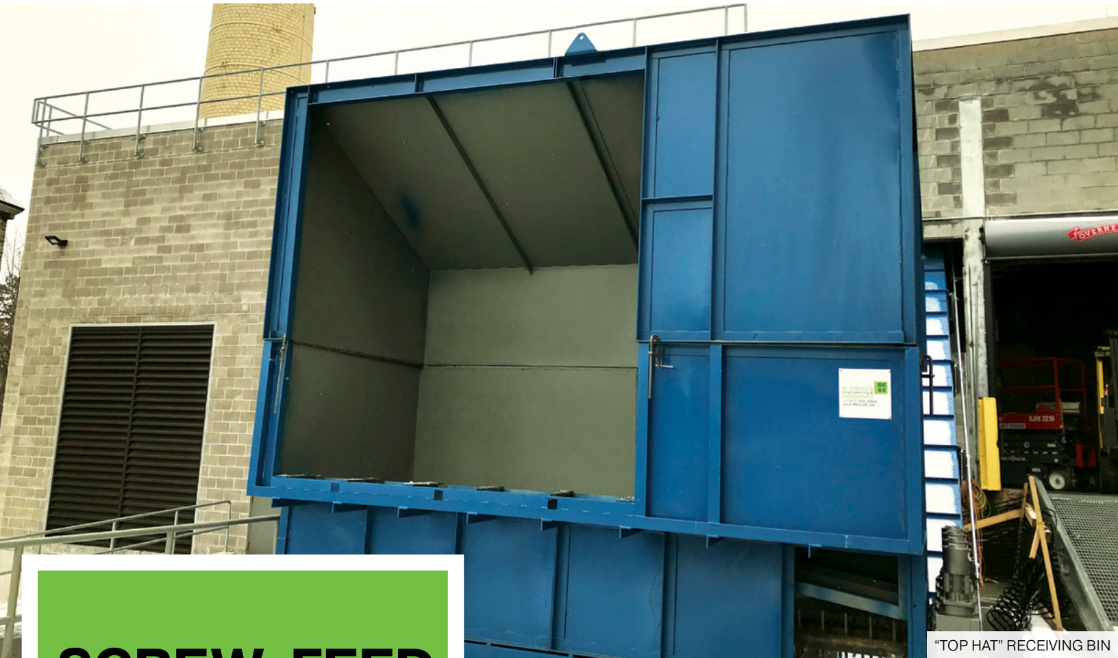
"TOP HAT" RECEIVING BIN