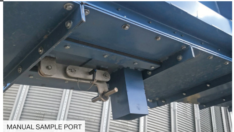
MANUAL SAMPLE PORT