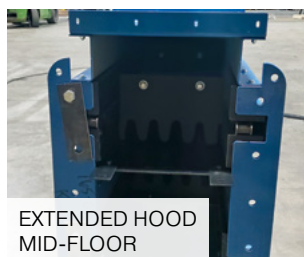
EXTENDED HOOD MID-FLOOR