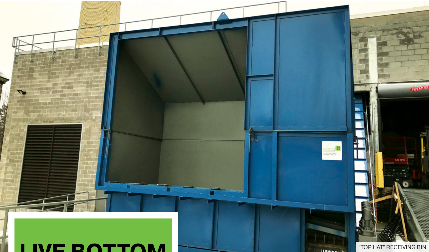
"TOP HAT" RECEIVING BIN