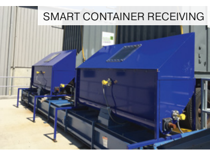
SMART CONTAINER RECEIVING